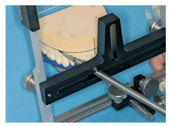
Fig 4 The working cast is positioned onto the fork, where it fits perfectly because of the occlusal indentation in the silicone. A pencil is used to trace the cast through the template; the horizontal line represents a parallel to the interpupillary line (front view), as well as a parallel to Camper's plane (side view). The vertical line represents the facial midline.