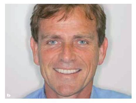
Fig 8a and 8b Clinical view of the final result (Zirconia Procera crown).

based upon the position of the patient's teeth in relation to the gingiva, lips, and face. The Ditramax system allows for the straightforward casting of the interpupillary line (the horizontal esthetic reference line) onto the oral area, which is used to identify major esthetic errors and then to develop a therapeutic program that will lead to a harmonious and naturallooking dentogingival solution. In addition to its diagnostic utility, the ability of the Ditramax to accurately represent all of the reference lines in the laboratory allows for a substantial reduction in dental