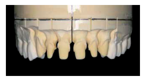
Fig 6 The cast base must be trimmed in parallel with the horizontal landmark. The separation axis of the dies must be oriented according to the vertical landmark.