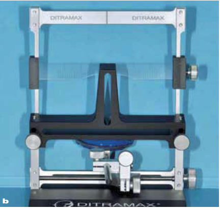
Fig 3 The entire device is removed from the patient and positioned on its stand. Both Camper's rods are removed and the tracing template is screwed to the device at the most suitable of the three available levels.